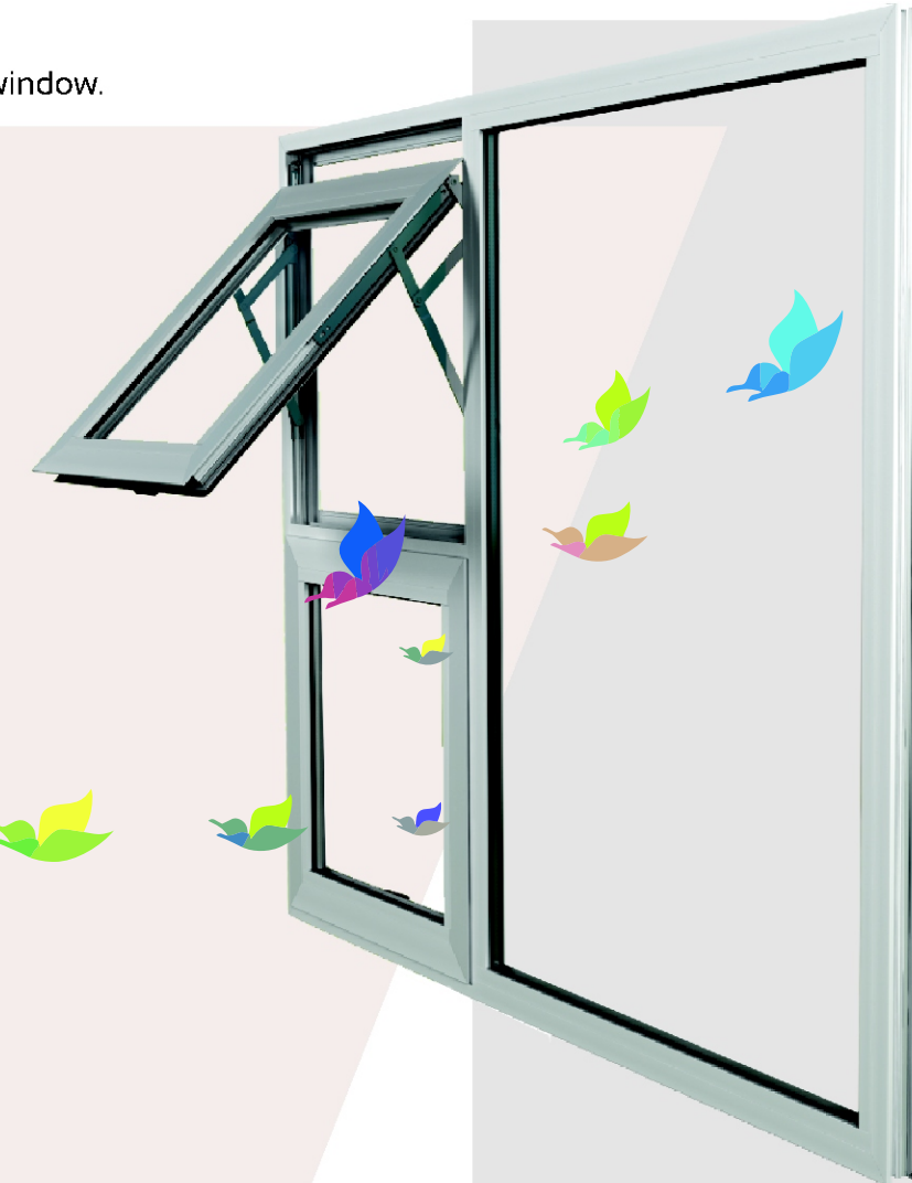
A 3D presentation of the Crealco Swift 30.5 cross-section